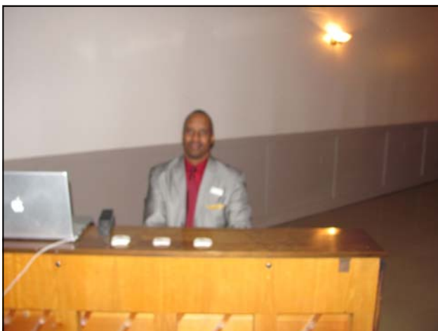
Live - Piano Music