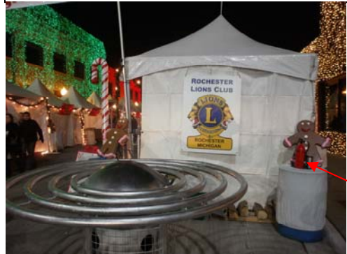
Fire extinguisher was available as required by the Rochester fire department

Thanks for contributors of Photographs, stories, etc.