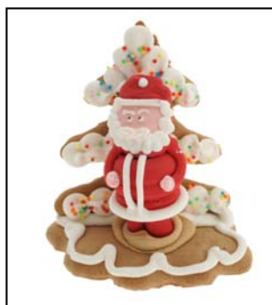
Ho Ho Ho !! Merry Christmas !!