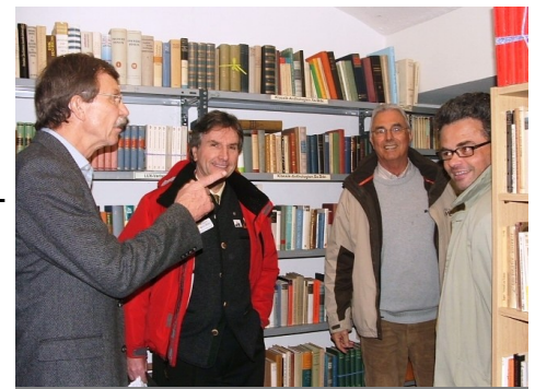
Murnau Staffelsee Lions Book Market