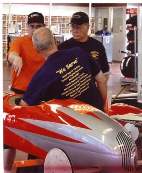
Skip volunteering at the Soap Box Derby display.