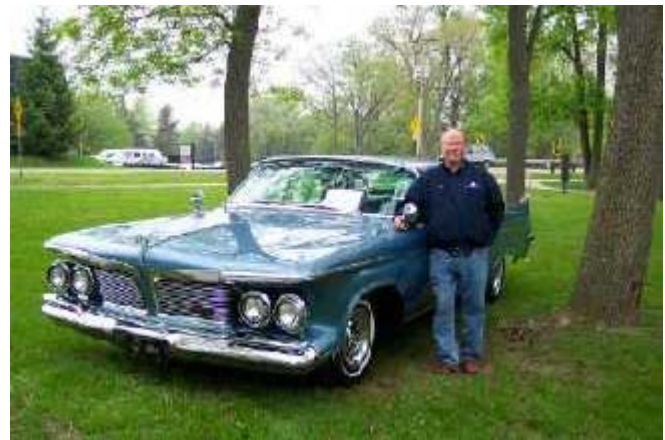
The Boys hard at work at the Car Show at the Heritage Festival. Hey - is that one of the Boys under the dash of Lion Dale's car?