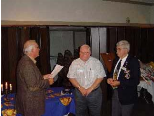
We welcomed four new members during the month of May to our club.