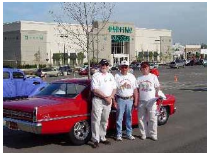
The Boys hard at work at Cruise Night (Monday Nights) at the Village of Rochester Hills. "So where did you get the new radio?"