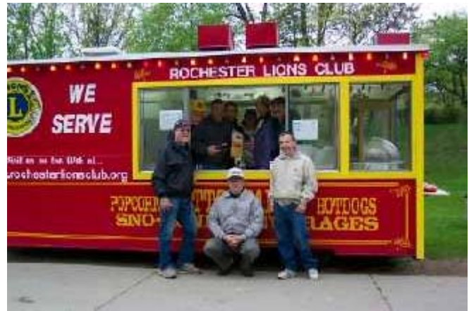
The Boys hard at work on the Food Wagon at the Heritage Festival. "I know where we can get a cool radio for my brother-in-law's Nova."